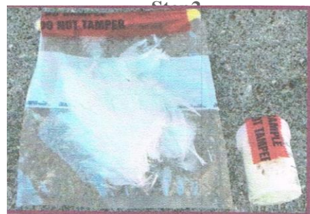
Steps 3, 4, and 5