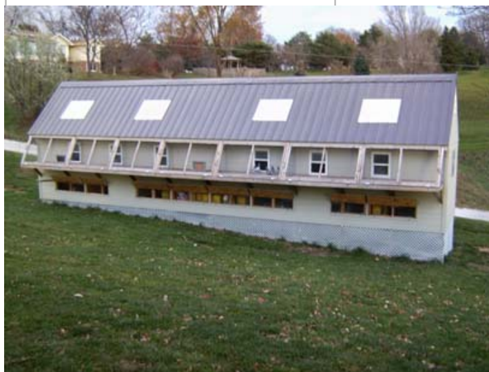
Carter Mayotte's Loft of 5 years. It is a duplicate from the loft he had in Florida.

The youth birds as well as all the other convention birds will be released together on the early races. We will separate out the youth results but will also publish a complete result sheet so the youngsters can see how their birds did against all the competitors. On October 22nd the youth birds will only be competing against other youth birds.